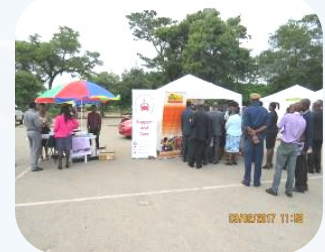
World Cancer Day

"It is much more important to know what sort of the patient has the disease than what sort of the disease a patient has" – William Osler