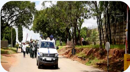
World Cancer Day