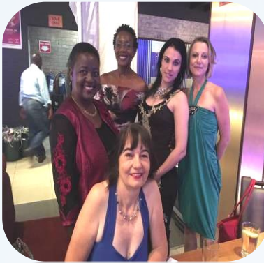
Fashion against cancer