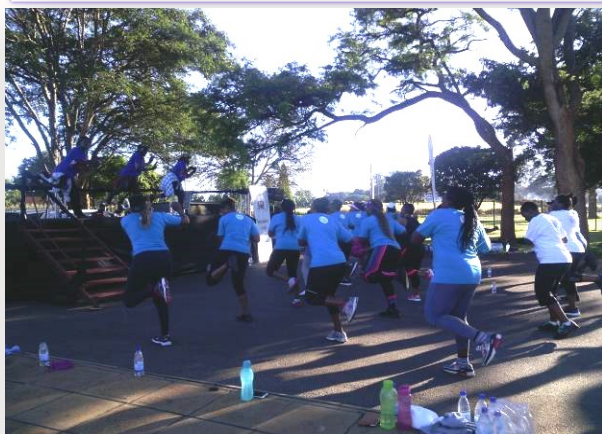
Zumba (1 April 2017, Westgate shopping Mall)-Harare