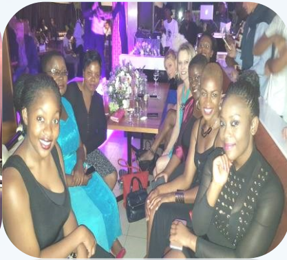
Fashion against cancer (11 February 2017, Sam Levy Village, Harare)