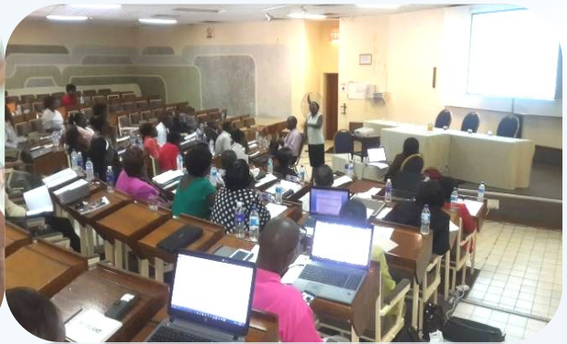
Ear and Hearing Strategy Development- (Ministry of Health And Child Care Workshop (13-18 February 2017, Kadoma))