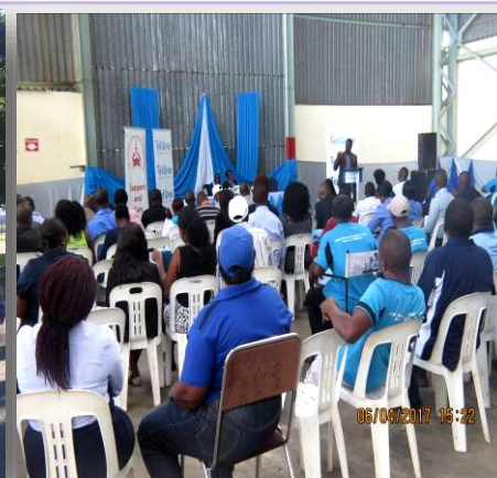
Workplace Wellness- Telone (5-6 April 2017, Gweru)